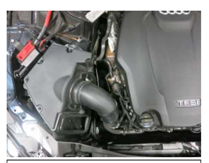
d. Loosen the hose clamp on the intake pipe at the turbo inlet.