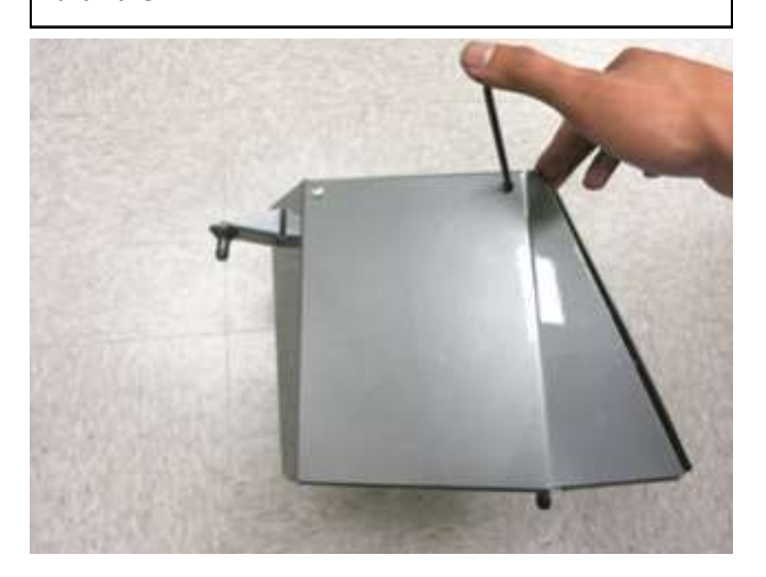
g. Install the two halves of the air box together. Due to variances in the manufacturing process, slight misalignments between the holes and threaded nut-serts may be present. You can align one hole with a small screwdriver while tightening the adjacent hole.