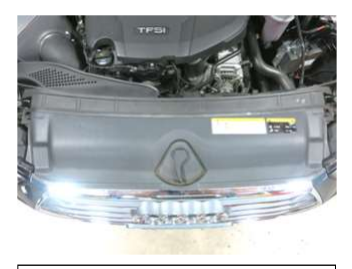
o. Finally, reinstall the radiator shroud and hood release latch.