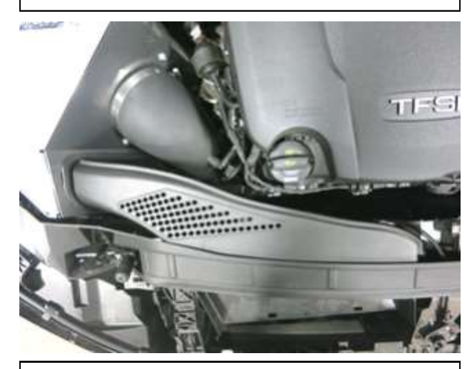
n. Reinstall the inlet scoop. Slide the scoop into the rubber gasket first then align with the core support. Secure with the [2] T25 Torx bolts removed in step 2c.