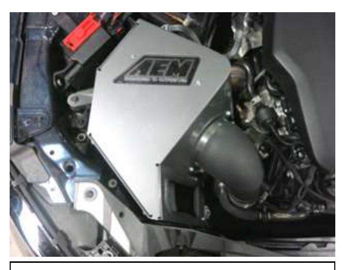
I. Place the air box into the engine bay. Align the [3] push-in studs and make sure they seat into their respective grommets. Make sure the coupler is fully seated onto the turbo inlet then tighten both hose clamps.