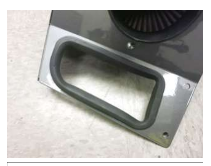
f. Install the rubber gasket removed in step 2g.