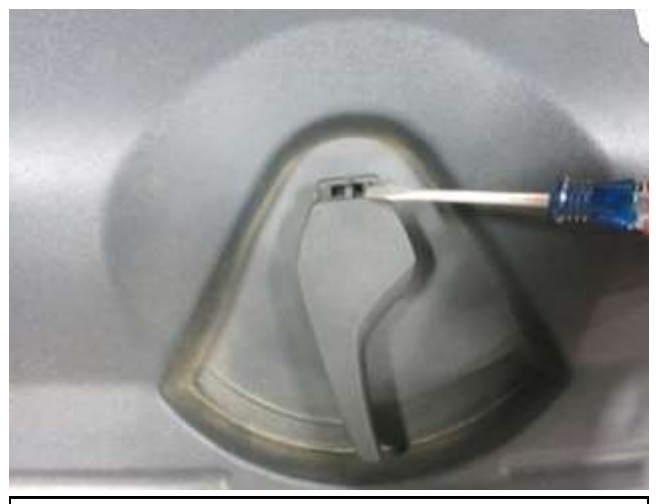
a. Use a small flat head screwdriver to pull out the retaining clip and remove the hood release lever.