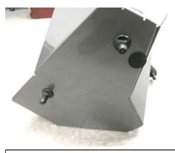
b. Install the remaining studs on the bottom of the lower half of the AEM air box. Then apply the rubber adhesive pad in the approximate location shown.