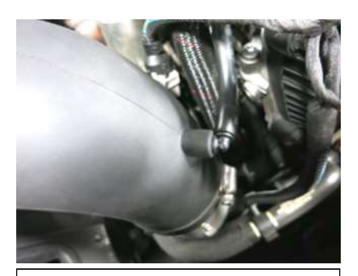
m. Install the vacuum hose onto the fitting.