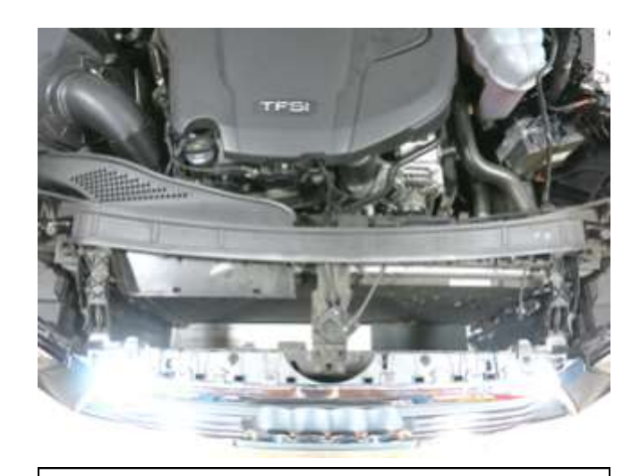
b. Carefully pull the radiator shroud out.