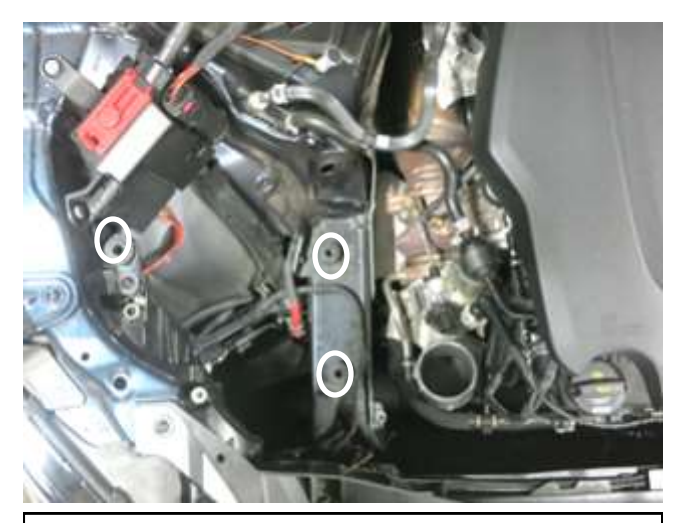
f. Pull up on the air box and remove it. Ensure the [3] grommets shown above are still in place. Do not discard any factory components or hardware.