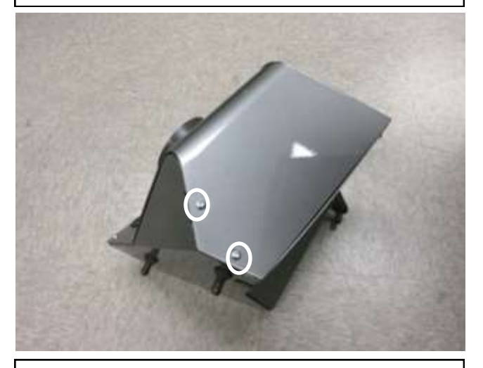
i. Install [2] bolts shown above.