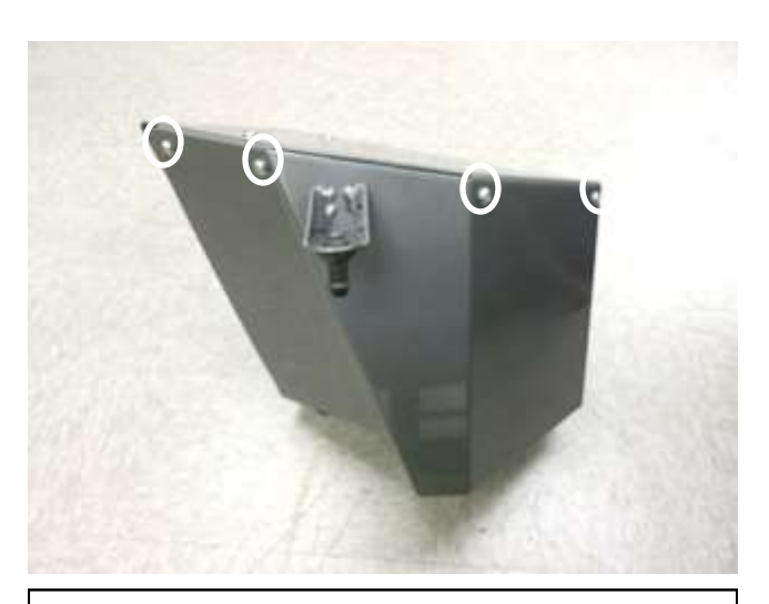
h. Install [4] bolts show above.