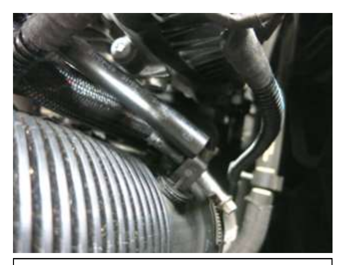
e. Pull the small vacuum line from the nipple on the intake pipe.