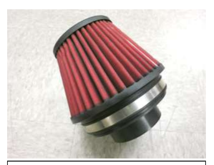
d. Install the AEM filter onto the velocity stack with the supplied hose clamp.