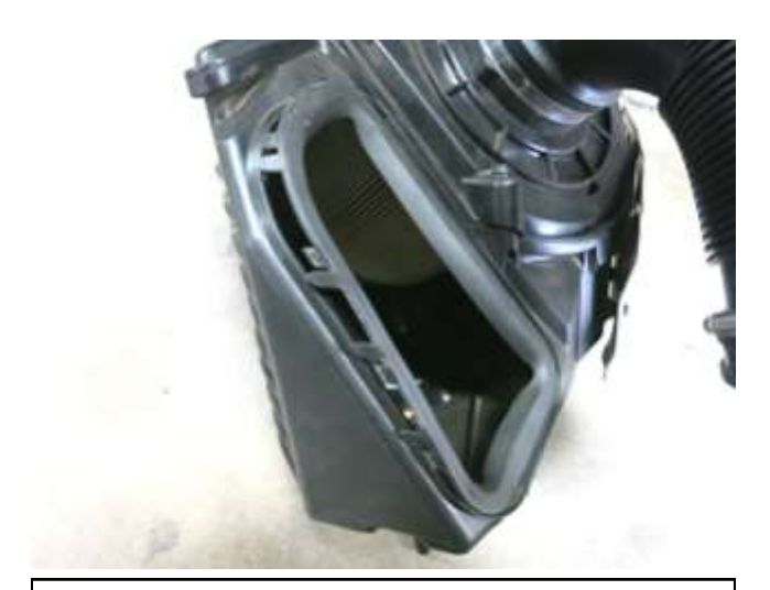
g. Carefully pull the inlet scoop gasket from the air box. You will reuse this later in step 3f.