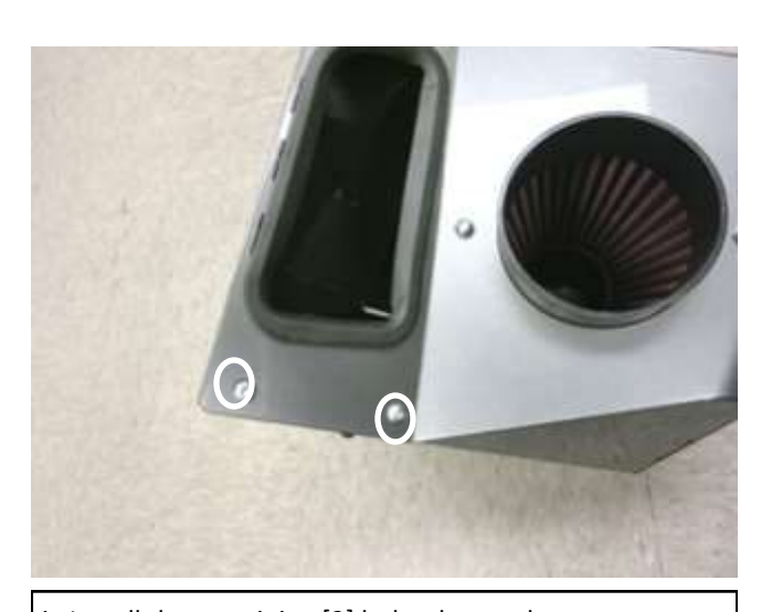
j. Install the remaining [2] bolts shown above.