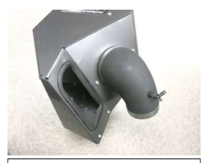
k. Loosely install the coupler with hose clamps. Then install the vacuum fitting into the coupler.