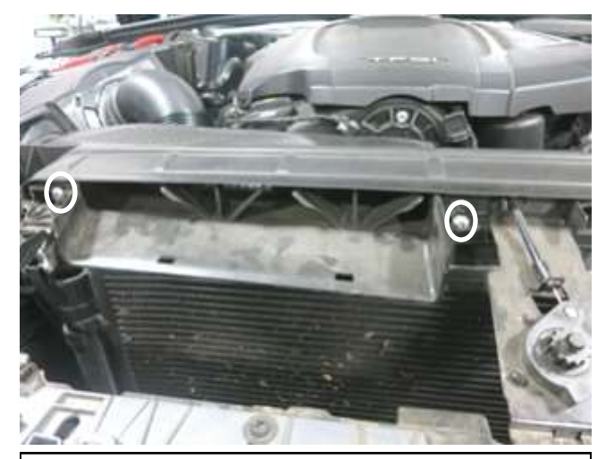
c. Remove the [2] T25 Torx screws shown above and remove the air inlet scoop.