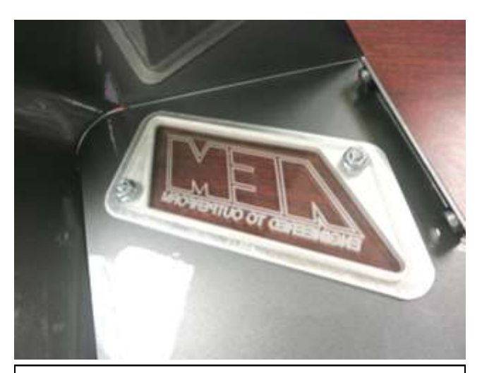
c. Install the clear AEM plate. Make sure to install the aluminum offset spacer in between the air box and plate.