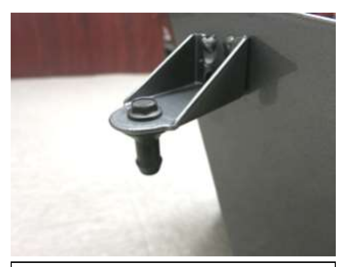
a. Install the push-in stud on the mounting bracket as shown.

a. When installing the intake system, do not completely tighten the hose clamps or mounting hardware until instructed to do so.