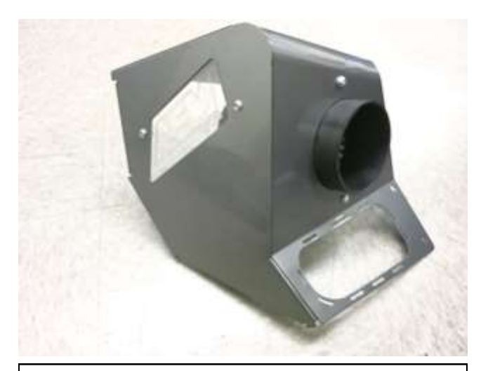
e. Install the AEM filter with velocity stack onto the air box. Refer to the exploded view for the appropriate hardware.